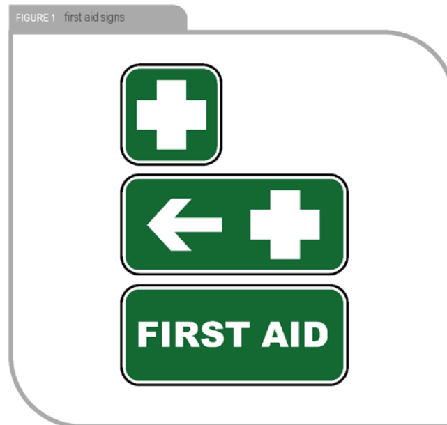
Figure 1 First aid signs