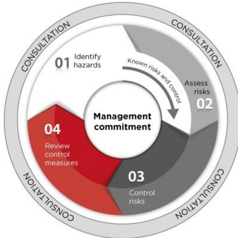
Figure 1 The risk management process

Further information is available in Safe Work Australia's Interpretive Guideline: The meaning of 'reasonably practicable' . The process of managing risk described in this Code will help you decide what is reasonably practicable in particular situations so that you can meet your duty of care under the WHS laws.